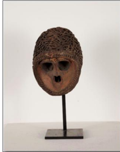
Skull Medicine Object (Nkisi Mbumba) 19th-20th Century Bone, rattan, pigment HU96.55

LONG ISLAND COMMUNITY FOUNDATION LICF a division of THE NEW YORK COMMUNITY TRUST